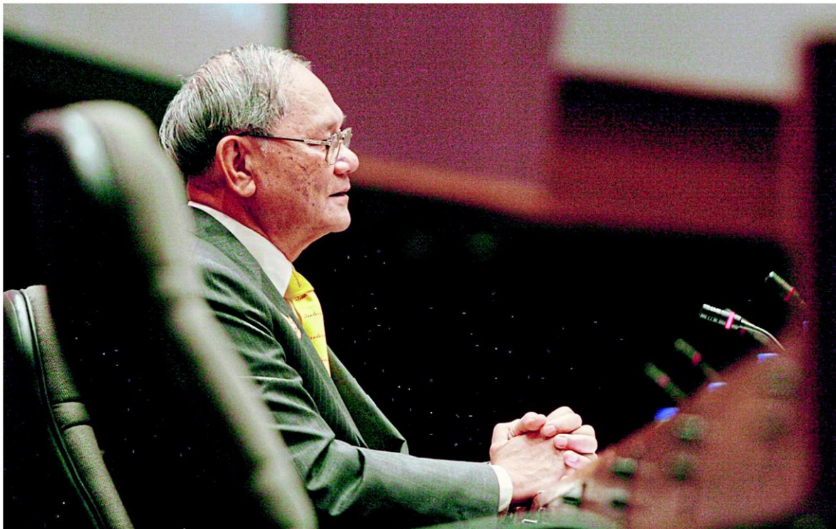
Senior legal adviser Meechai Ruchupan, left, is a leading candidate to become chairman of the new charter drafting body. The legal expert has close ties with Bowornsak Uwanno, bottom left, chairman of the original Charter Drafting Committee and Deputy Prime Minister Wissanu Krea-ngam, bottom right.