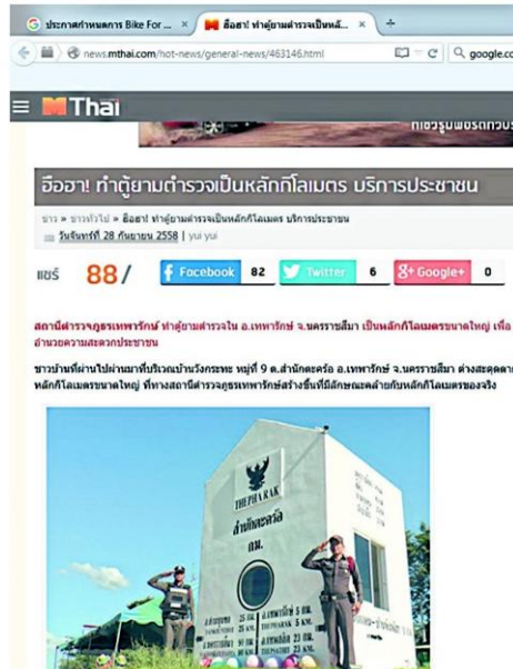
A police booth in the form of a kilometre marker in Nakhon Ratchasima wows motorists and social media users.

“What they should do is stop cyclists who are over the limit and keep them at the checkpoint until they sober up,” he said.