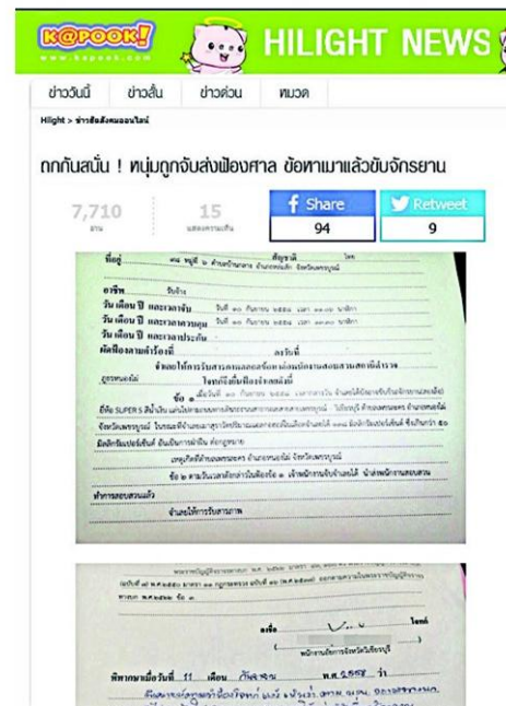
An image of police document contains details about the charge against a drunk cyclist. Below is a court ruling that acquitted him.